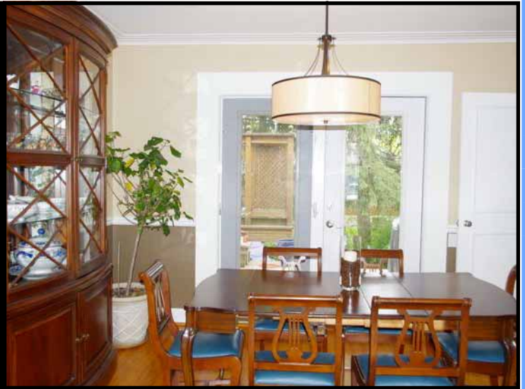
Walk-out from Dining to Deck