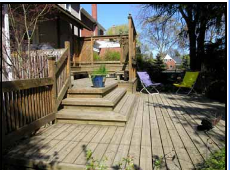
Two-tiered Backyard Deck